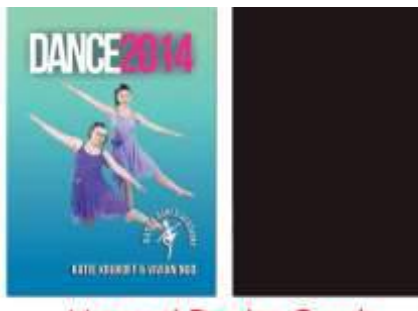
Magnet Trader Cards